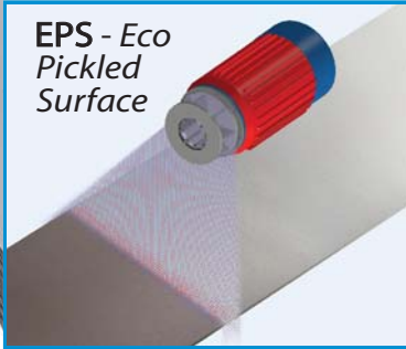
EPS - Eco Pickled Surface

The Flat Rolled Steel Sheet Product That Outperforms Acid Pickled, Dry or Oiled, Plus Hot Roll Black And SCS GUARANTEED